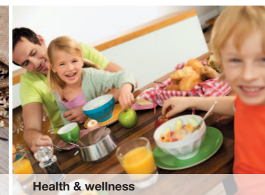
Health & wellness