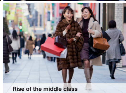
Rise of the middle class